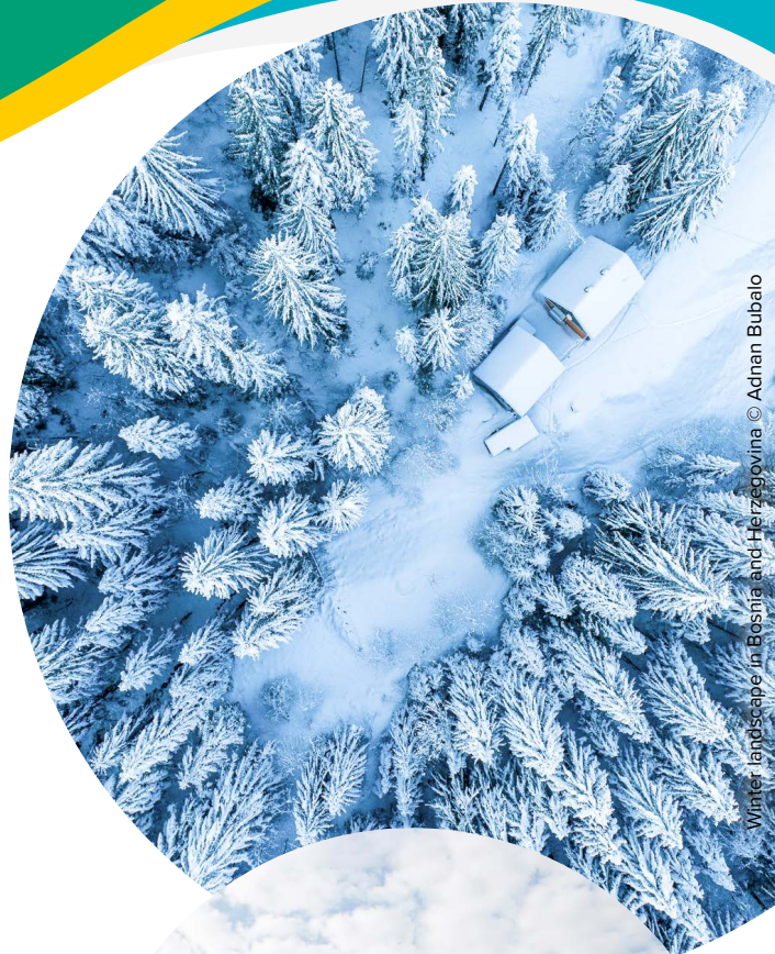
Winter landscape in Bosnia and Herzegovina

In the long-term, the project will contribute to the process of BiH becoming a member of the European Union. The document will also be a critical tool for relevant authorities to improve the state of the environment in BiH and improve overall citizen health and well-being for current and future generations.