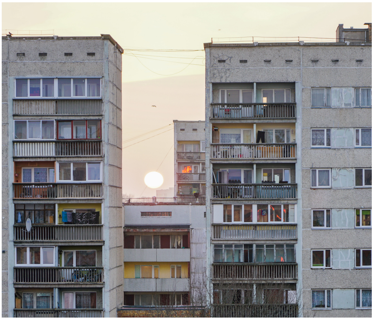
Low\mbox{-income residential area in Europe. Photo: Zigmunds \mbox{ Dizgalvis, Gettylmages}