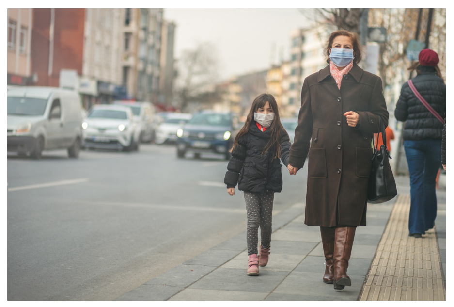
Woman and child wear masks to protect tagainst air pollution.

2018-2022 (Gender Equality Agency of Bosnia and Herzegovina, 2018) and the BiH Disability Policy (Ministry of Human Rights and Refugees of BiH, 2008) (see Annex 1 and 3). The Law on Gender Equality, for example, requires gender impact assessments of policy and legislative processes (Law on Gender Equality in Bosnia and Herzegovina [Official Gazette of BiH, No. 32/10], 2010). Various GESEP policy documents highlight the interlinkages with the environment, such as the BiH Gender Action Plan (GAP) (Gender Equality Agency of Bosnia and Herzegovina, 2018),<sup>5</sup> the RS Strategy for Improving the Situation of Women in Rural Areas,<sup>6</sup> and the BiH Strategy for addressing the issues of Roma (Ministry of Human Rights and Refugees of BiH, 2005).<sup>7</sup>