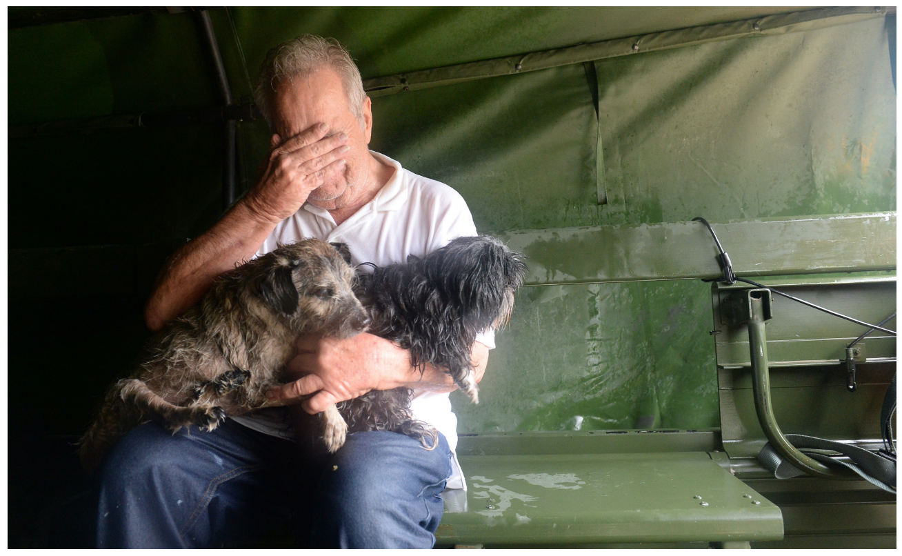
Man and dogs after flooding event.

compared with 15.9% for the whole labour force (14.1% for men and 18.5% for women) (ILOSTAT, 2020). The variation in environmental attitudes suggests that information campaigns and public engagement on environmental matters would most likely benefit from a more nuanced approach.