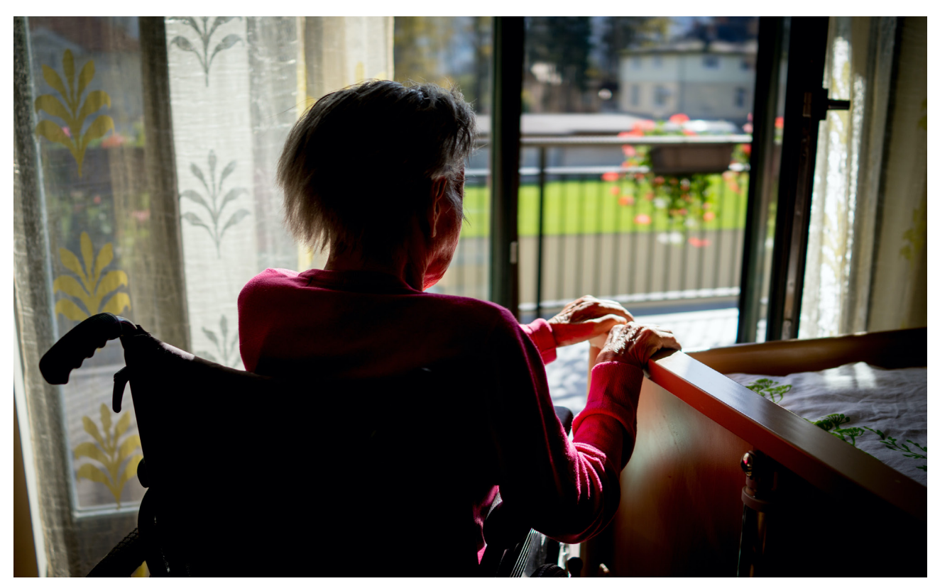
Elderly woman in wheelchair in Sarajevo, BiH.

Another marginalized group is the returnee population, which has limited access to rights related to the labour market, social benefits and health care (Committee on the Elimination of Racial Discrimination, 2018). The 2013 BiH Census, which gathered data on returnees, found that of the approximately 450,000 people that had fled the country during the 1992-1995 war, about 70% had returned to the place from which they had fled, 24% had returned to another place in BiH and less than 2% had remained abroad.<sup>14</sup>