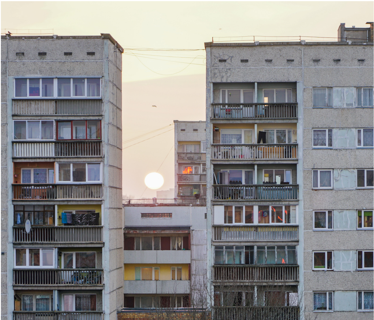
Low-income residential area in Europe.