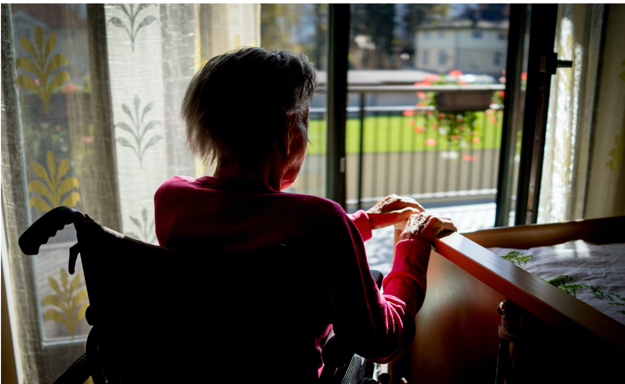
Elderly woman in wheelchair in Sarajevo, BiH.

Another marginalized group is the returnee population, which has limited access to rights related to the labour market, social benefits and health care (Committee on the Elimination of Racial Discrimination, 2018). The 2013 BiH Census, which gathered data on returnees, found that of the approximately 450,000 people that had fled the country during the 1992-1995 war, about 70% had returned to the place from which they had fled, 24% had returned to another place in BiH and less than 2% had remained abroad. 14