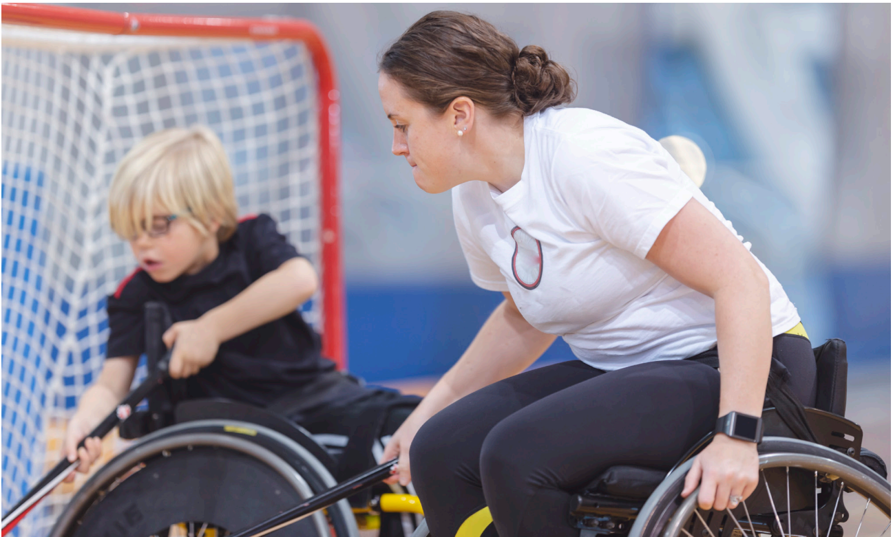
Persons with mobile impairment playing sports.

persons, and a series of 2016 amendments to the Law established the prohibition of discrimination based on sexual characteristics, a key step to protecting intersex persons' human rights. Nevertheless, in practice, the rights of transgender and intersex persons in BiH are still not sufficiently protected (Pandurević et al., 2020). For instance, the right to self-determination (in this case with regards to gender or gender identity determination) is either limited or rendered impossible by existing legal solutions and practices (Išić, 2018).