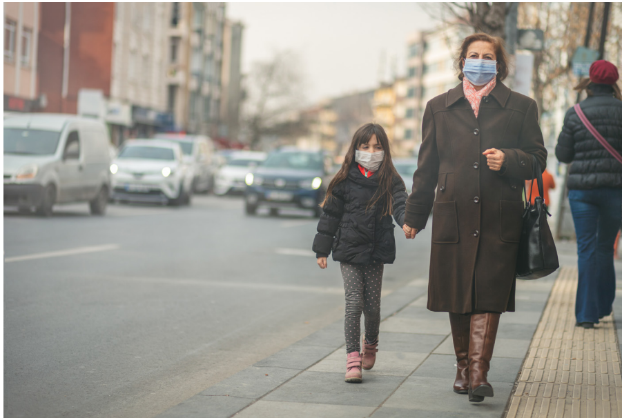
Woman and child wear masks to protect against air pollution.

2018-2022 (Gender Equality Agency of Bosnia and Herzegovina, 2018) and the BiH Disability Policy (Ministry of Human Rights and Refugees of BiH, 2008) (see Annex 1 and 3). The Law on Gender Equality, for example, requires gender impact assessments of policy and legislative processes (Law on Gender Equality in Bosnia and Herzegovina [Official Gazette of BiH, No. 32/10], 2010). Various GESEP policy documents highlight the interlinkages with the environment, such as the BiH Gender Action Plan (GAP) (Gender Equality Agency of Bosnia and Herzegovina, 2018), 5 the RS Strategy for Improving the Situation of Women in Rural Areas, 6 and the BiH Strategy for addressing the issues of Roma (Ministry of Human Rights and Refugees of BiH, 2005). 7