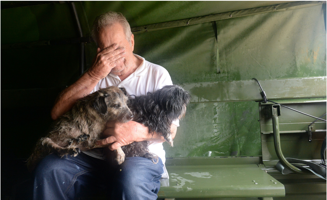
Man and dogs after flooding event.

compared with 15.9% for the whole labour force (14.1% for men and 18.5% for women) (ILOSTAT, 2020). The variation in environmental attitudes suggests that information campaigns and public engagement on environmental matters would most likely benefit from a more nuanced approach.